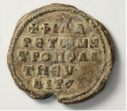
Fig. 1.3 Seals of Philaretos, Metropolitan of Euchaita, Tenth Century/o-r.

Recruiter. The saint was celebrated by two collections of miracles and a well-known panegyrion (market fair) (Brandes 1999, 48–49).